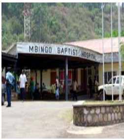
Mbingo Baptist Hospital Entrance

The Baptist General Conference (BGC), in association with the Cameroon Baptist Convention, has helped to establish Mbingo Baptist Hospital in the Northwest Province of Cameroon. Founded in 1952, this 250 bed facility is considered to be one of the best hospitals in the country. Staff members there are making a difference in the lives of a million people every year by attending to their physical needs, while at the same time offering hope for their spiritual emptiness and confusion.